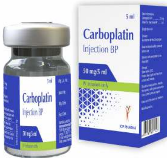
5 ml Carboplatin Injection