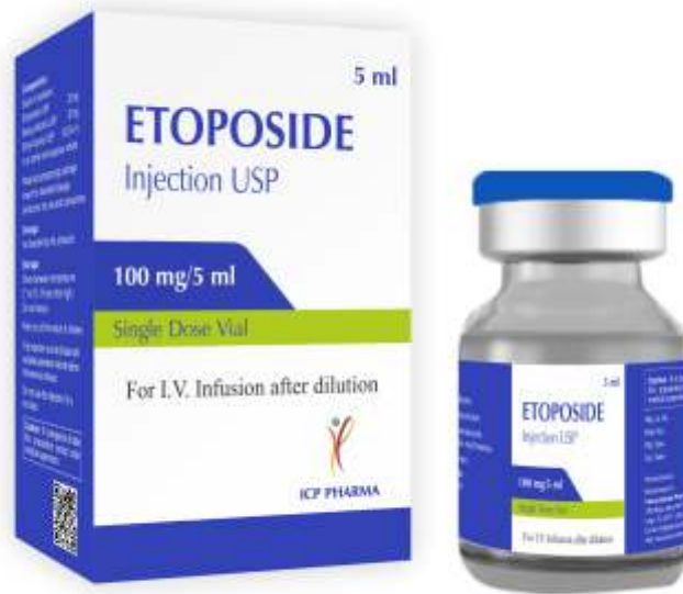
100 mg/5 ml Etoposide Injection